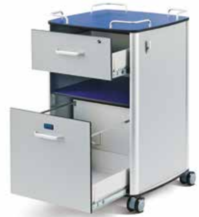
The Bedside Cabinet has two large drawers easily accessible by the patient whilst in bed.