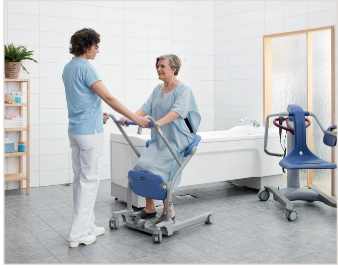
A resident (mobility level A-C) using the Comfort Dry Robe provides dignity during transfer to the hygiene lift.

The Comfort Dry Robe is made of Egyptian cotton and is designed to easily cover and keep the body warm before and after the hygiene routine. With a simple button in the neckline, the robe is kept in place, while also making it easy to put on and remove.