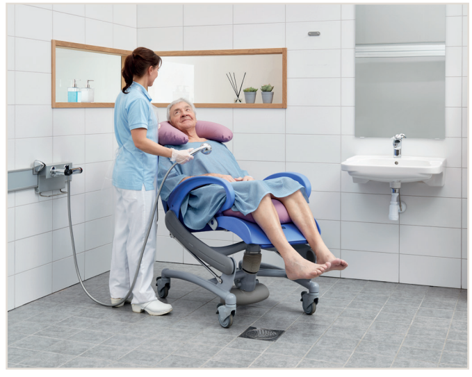
A combination of ways to use the Comfort Cushion and Comfort Wet Robe for additional comfort during showering.

The Comfort Cushion can be used both in dry and wet environments as it is completely waterproof. The multifaceted half-moon shape design is intended to fit a wide range of residents to provide extra comfort where needed; e.g. as neck support, in the lap for extra arm or hand rest, on the sides of the upper body or to be placed under the knees or legs. Transfers into a bathtub using a hygiene lift or ceiling lift can leave the person feeling very exposed. The Comfort Wet Robe is an accessory designed to cover the body during transfers and hygiene routines in a hygiene chair, shower trolley or bathtub while still giving the caregiver access to the resident's body for cleaning.