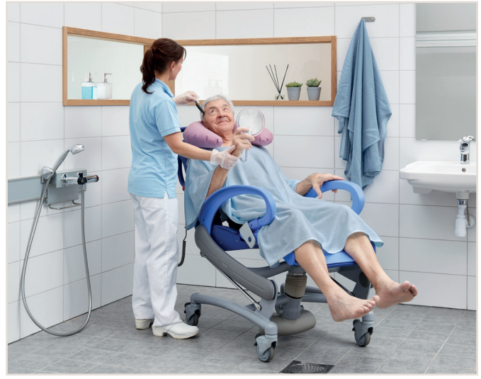
A dependent resident (mobility level D) using the Comfort Dry Robe in combination with the Comfort Cushion can support comfort during the hygiene process.