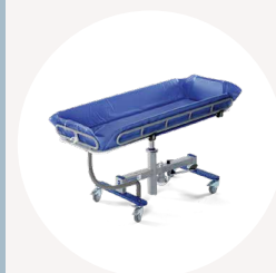
Concerto® / Basic®

Shower trolley designed for pressure redistribution and comfort for patient and caregiver