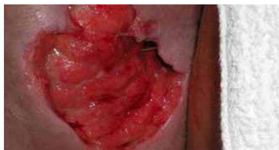
A. Ruptured abscess with skin breakdown

Facility Name: Baylor Specialty Hospital Facility Location: Dallas, TX