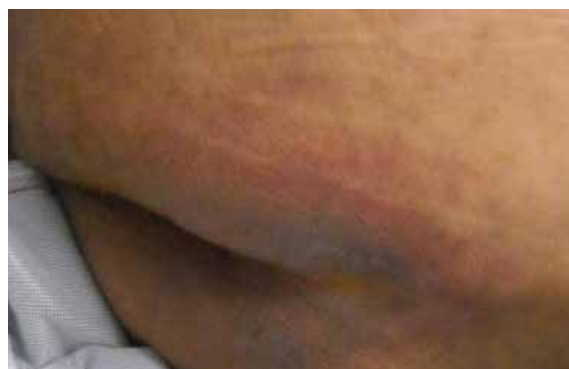
C. 18 days post Skin IQ MCM