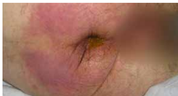
B. 6 days post Skin IQ MCM