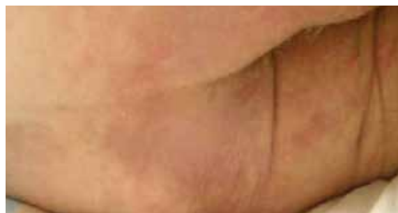
D. Follow-up at day 30