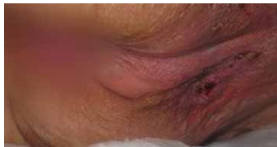
C. 27 days post Skin IQ MCM