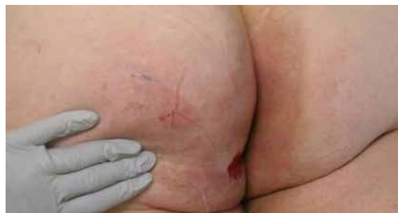
C. Peri-wound condition - 18 days post Skin IQ