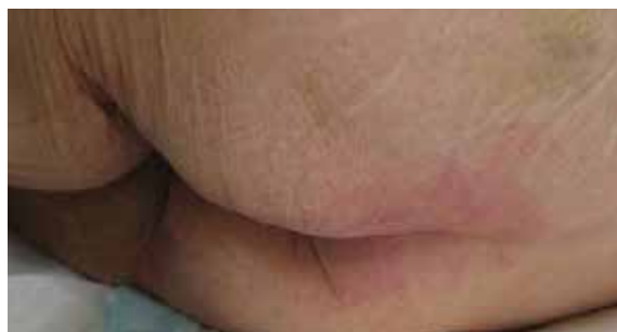
D. 17 days post Skin IQ