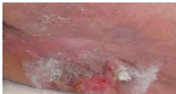
D. Follow-up at day 30 (after transfer to low air loss)