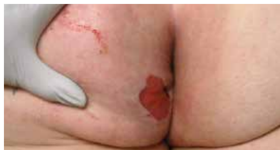
D. Peri-wound condition - 20 days post Skin IQ