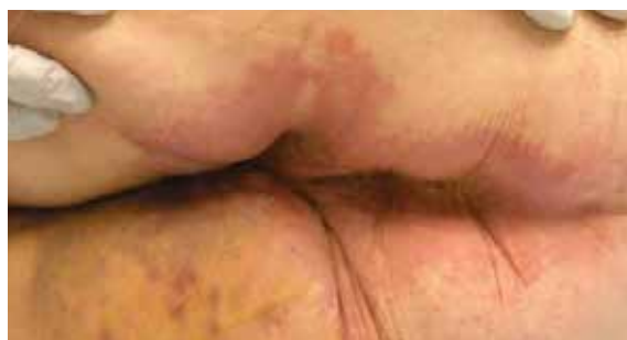
A. Initial skin breakdown

Facility Name: Baylor Specialty Hospital Facility Location: Dallas, TX