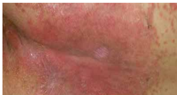
A. Initial skin breakdown

Facility Name: Baylor Specialty Hospital Facility Location: Dallas, TX