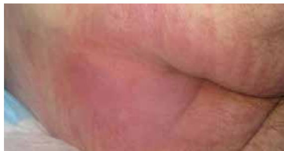
C. 27 days post Skin IQ MCM