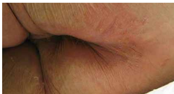
B. 7 days post Skin IQ