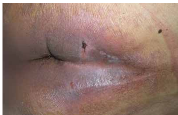
B. 5 days post Skin IQ MCM