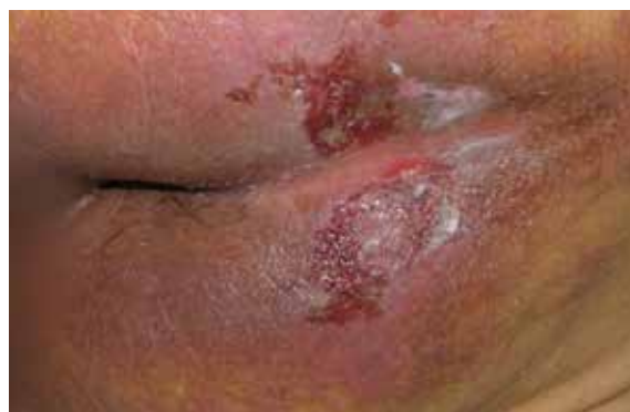
A. Initial skin breakdown

Facility Name: Baylor Specialty Hospital Facility Location: Dallas, TX