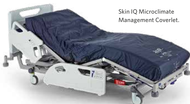
Skin IQ Microclimate Management Coverlet.

The following booklet provides an overview of the Skin IQ Microclimate Management Coverlet, and presents evaluation and case study data, to demonstrate its practical application and how it performs in the clinical environment.