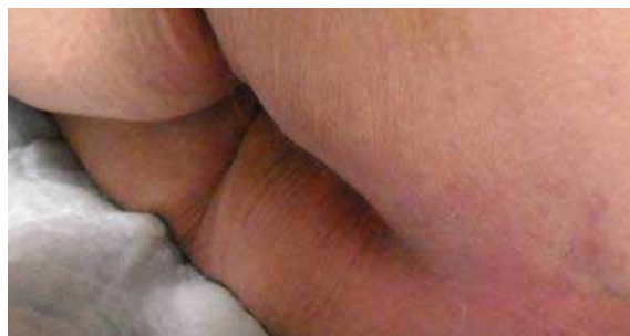
C. 14 days post Skin IQ