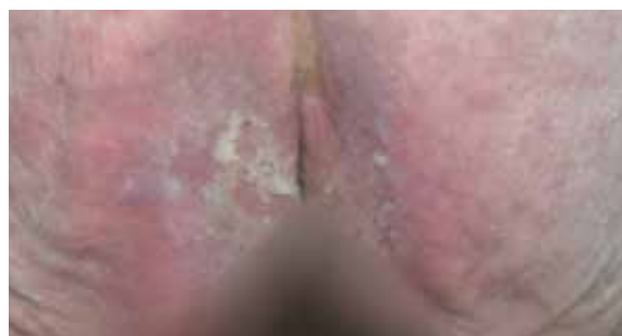
A. Initial skin breakdown

Facility Name: Baylor Specialty Hospital Facility Location: Dallas, TX