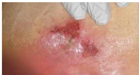
B. 6 days post Skin IQ MCM