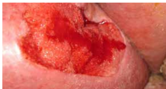
B. Peri-wound condition - 7 days post Skin IQ